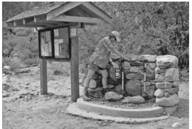
Just 100 yards from the boat beach is a bulletin board and a water spigot for filling water jugs. Check here for emergency bulletins, weather and water flow information.

Upper Cremation Camp , at river mile 87.7 on river left, is just above the riffle formed by a debris fan. This small camp is susceptible to flash flooding in monsoon season and is a very popular camp for river trips exchanging trip participants at Phantom Ranch.