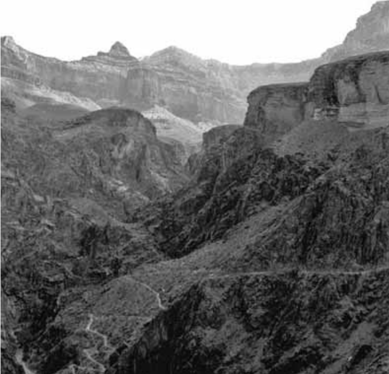
If you are exchanging passengers at Phantom Ranch, the hike offers spectacular views. This is looking back down Pipe Creek.