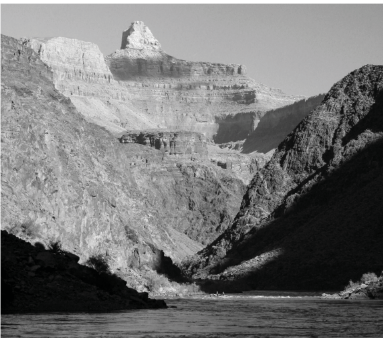
Zoroaster Temple is about two miles northeast from the river at river mile 86.5 and 4,700 feet above the river. (Tom Martin)

Horn Creek Rapid , at river mile 90.8, is a truly fun rapid. At low water flows of 7,000 cfs or below, the run is a right-to-left move, going right of the right horn with momentum to the left. At higher water levels, it is possible to “split the horns” and enter left of the right horn. Mind the wall on the left at the bottom. This rapid can best be scouted on river right. The pull-in for this scout is just above the rapid.