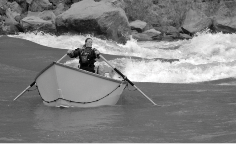
Approaching Horn Creek Rapid. Much of the work of rowing the big rapids is in the set-up. (Brian Coggan)

Start at the bottom! Text reads from bottom of page to top on all map pages along with the river!